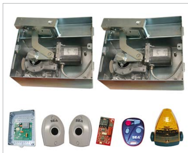
KIT B 400