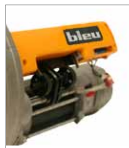
Limit switch Fin de carrera